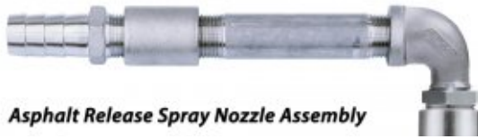
Asphalt Release Spray Nozzle Assembly