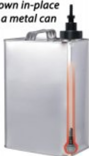
#709101-M Shown in-place on a metal can