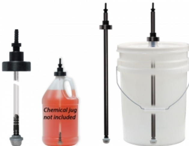
# 709101 (various models) 1 Gallon Safe Flow Lid™ with Flexible Tube & Strainer