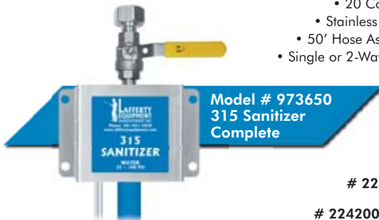
Model # 973650 315 Sanitizer Complete

# 224215 5 Gallon Stainless Steel Jug Rack – inside dimensions 12” x 12”