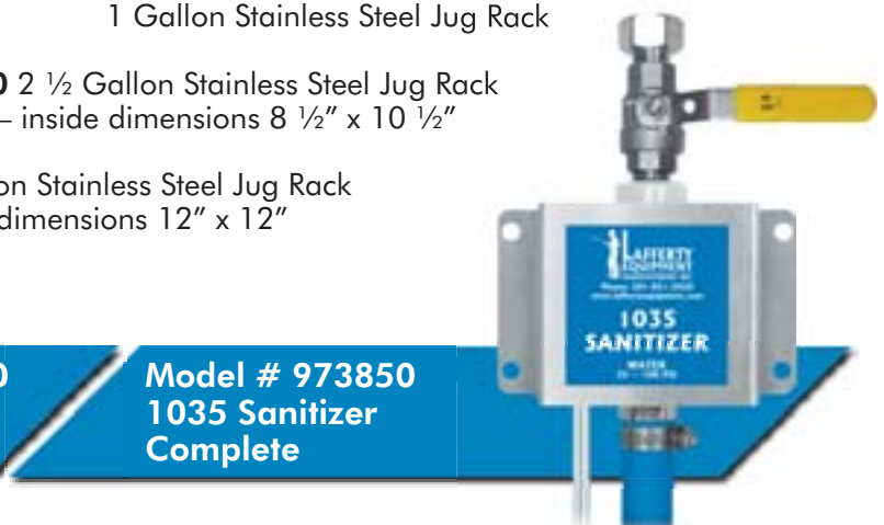
Model # 973850 1035 Sanitizer Complete