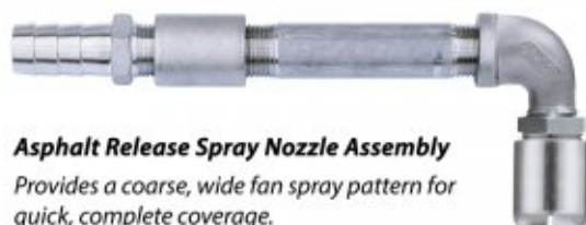
Asphalt Release Spray Nozzle Assembly Provides a coarse, wide fan spray pattern for quick, complete coverage.