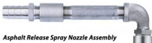
Asphalt Release Spray Nozzle Assembly