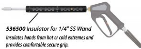
536500 Insulator for 1/4" SS Wand Insulates hands from hot or cold extremes and provides comfortable secure grip.