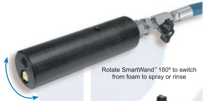
Rotate SmartWand™ 180° to switch from foam to spray or rinse