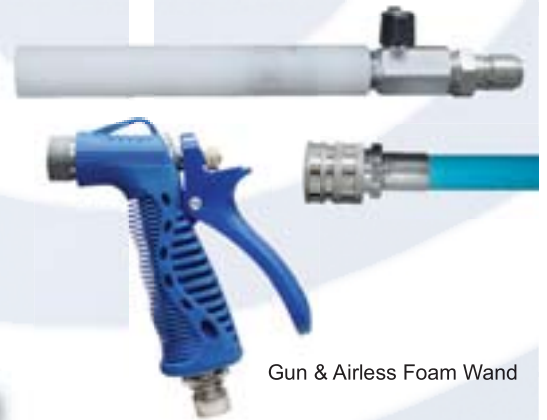
Gun & Airless Foam Wand