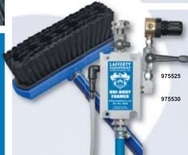
975525 Uni-Body Soft Brush Foamer Complete Includes 50' hose, 44" handle and foam brush head