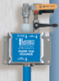
Pump Fed Foamers