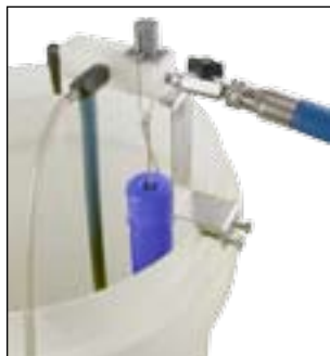
989004..... Level Master

Below and at right: 989070.... 40 Gallon Gemini Level Master