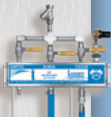
Hose Drop Stations